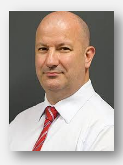
WELCOME RECEPTION & PLENARY 4 The Future of Work in the Age of Disruption and Digital Revolution