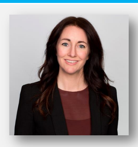
PLENARY 1 Superannuation – Solutions for Equality ("Not So Super for Women" Outworkings)