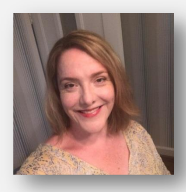
PLENARY 1 Superannuation – Solutions for Equality ("Not So Super for Women" Outworkings)