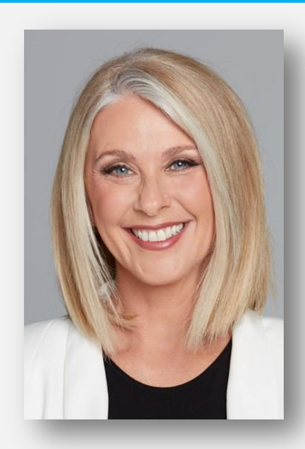
PLENARY 5 Keynote Speaker