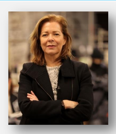
PLENARY 3 Change the Rules