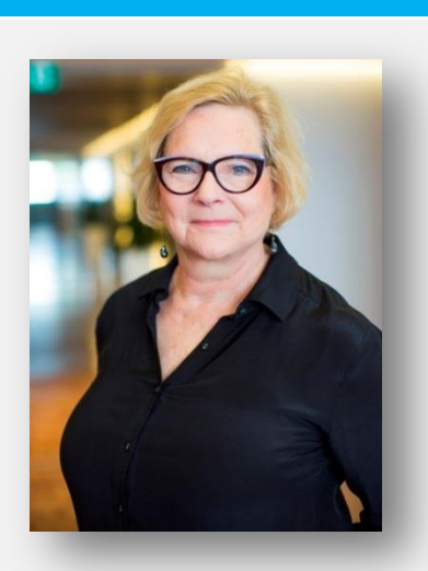
PLENARY 2 Reclaiming Local Government Functions