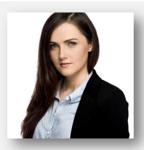
PLENARY 4 The Future of Work in the Age of Disruption and Digital Revolution