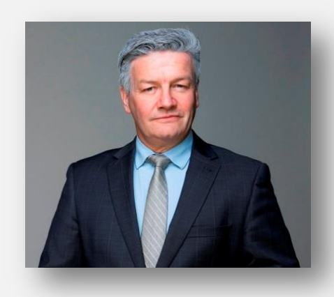
ENTERTAINMENT Malcolm Turnbull impersonator